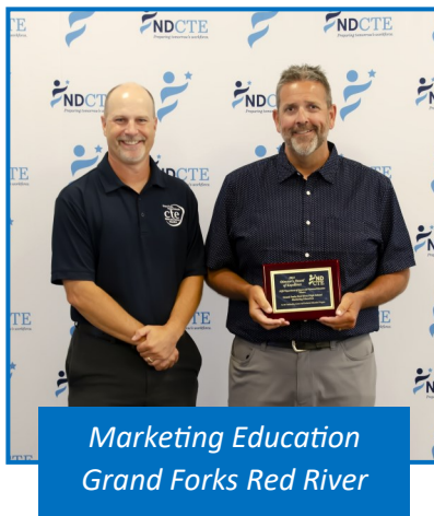
Marketing Education Grand Forks Red River