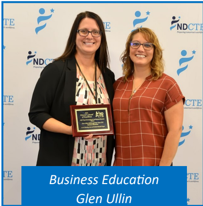
Business Education Glen Ullin

Congratulations to the following CTE Programs who received the Directors Award at the 2023 Professional Development Conference in Bismarck on Tuesday, August 8, 2023.