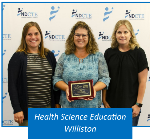
Health Science Education Williston