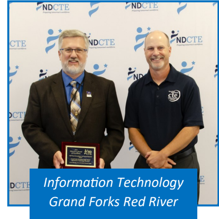
Information Technology Grand Forks Red River