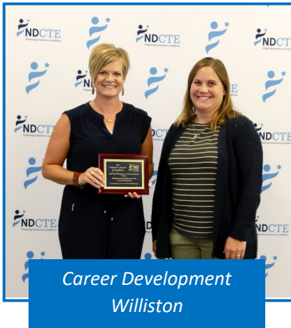
Career Development Williston