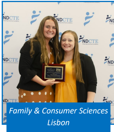
Family & Consumer Sciences Lisbon