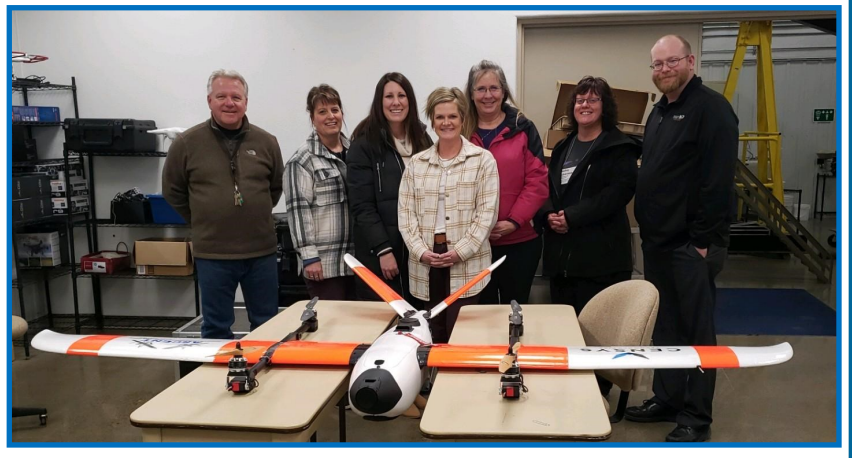
At the Minot International Airport.

Specialist, took the group on a tour of the airport including a visit with TSA which gave us an idea of what the job is like from their perspective. From there we went to the SRE facility and learned about snow removal at the airport and ended the tour at AVFLIGHT, who provides the airport and Minot area with flight and pilot services. We were excited to hear about the employment opportunities at both airports and received advice that is applicable to high school students planning a future career .