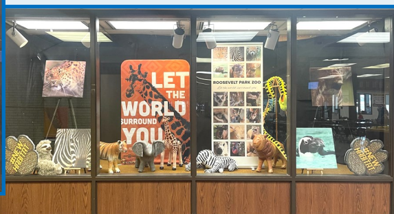
Examples of window displays this past year.