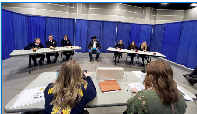
The quiz event allows chapters to showcase their FFA knowledge. This event begins with a written test. The top four teams advance to a semi-final and final live question round. The Glen Ullin FFA chapter was the high team in this event.