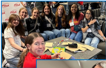
District 5 FCCLA members raised money for Juvenile Diabetes for ND and wrote cards to veterans.

There are service-learning projects happening across the state by students in all of the CTE student organizations. One requirement of an approved program is to provide leadership opportunities including service learning. Many students participate in CTSO organized conferences in the fall and the spring of the year. This fall there were many programs at the local and state levels where members were involved in service-learning projects. Here are a few of the projects.