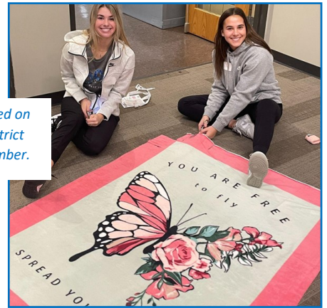
District III FCCLA members worked on tying blankets while at their district meeting in Grand Forks in November.