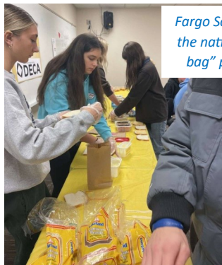
Fargo South DECA prepared lunches for the national program "Hashtag Lunch-bag" providing lunches for children.