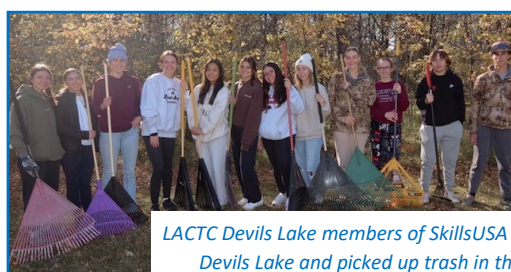
LACTC Devils Lake members of SkillsUSA raked leaves for the elderly in Devils Lake and picked up trash in the ditches around the city.