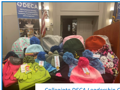
Collegiate DECA Leadership Conference participants collected over 100 hats, mittens, scarves and coats for the Bridge the Gap Program in Fargo.