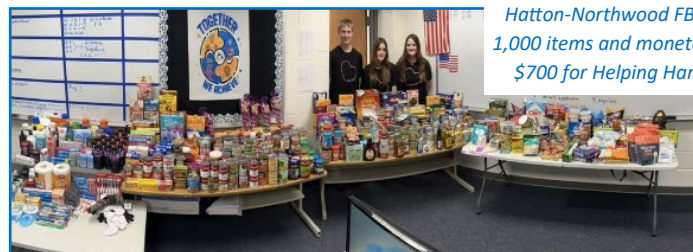
Hatton-Northwood FBLA collected over 1,000 items and monetary donations over $700 for Helping Hands Food Pantry.