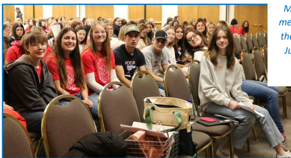
Members attending the District 1 FCCLA meeting were able to pay to wear jeans to the meeting. They donated the money to Juvenile Diabetes Research Foundation.