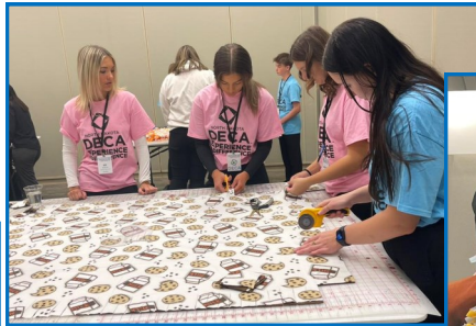
DECA members at the Fall Leadership Conference tied 47 blankets and donated them to Sanford Health Childrens Cancer Center.